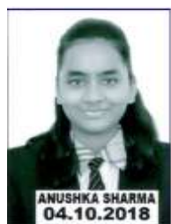
ANUSHKA SHARMA (96%)