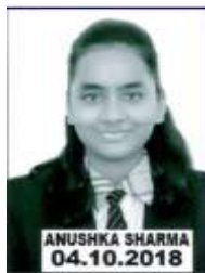
ANUSHKA SHARMA (94.4%)